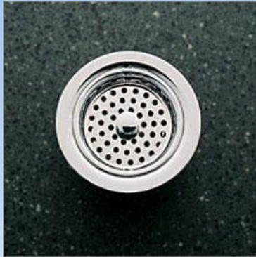
Use screens in all drains to eliminate food particles from entering treatment units