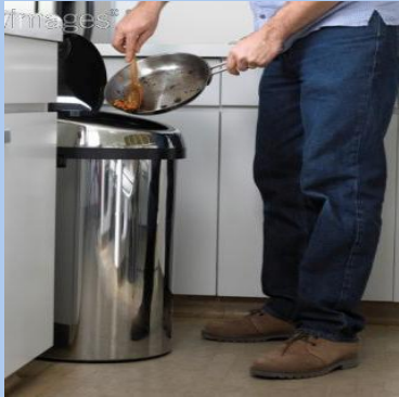
Scrape pots and pans prior to washing