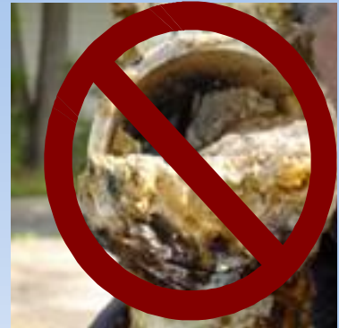
Perform inspections and cleaning in accordance with the recommendations listed below. Document inspections and cleaning in proper logs