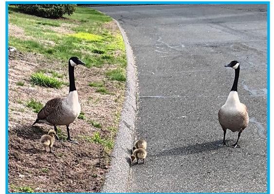
Mr & Mrs Goose-tav with Huey, Dewey & Louie